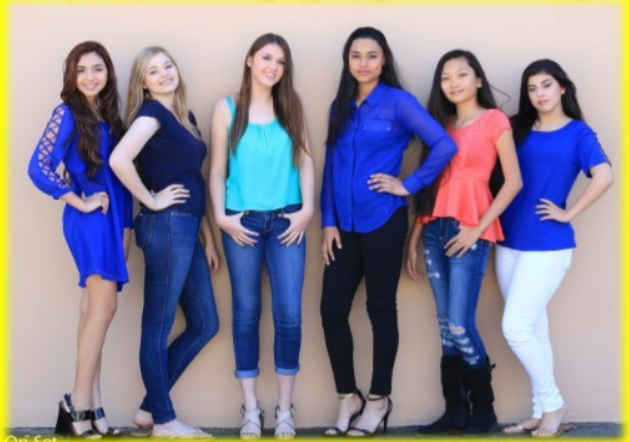
Image & Confidence/ Modeling 1