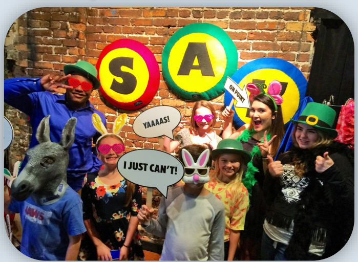
Maile School's All Star Troop having fun at their class fieldtrip at SAK!