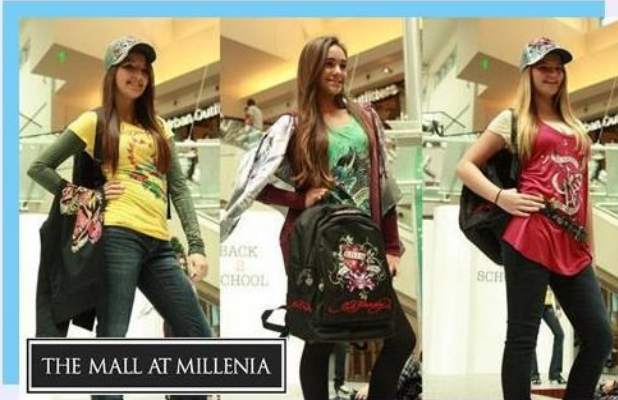
THE MALL AT MILLENIA

Looking for something fun to do this summer?